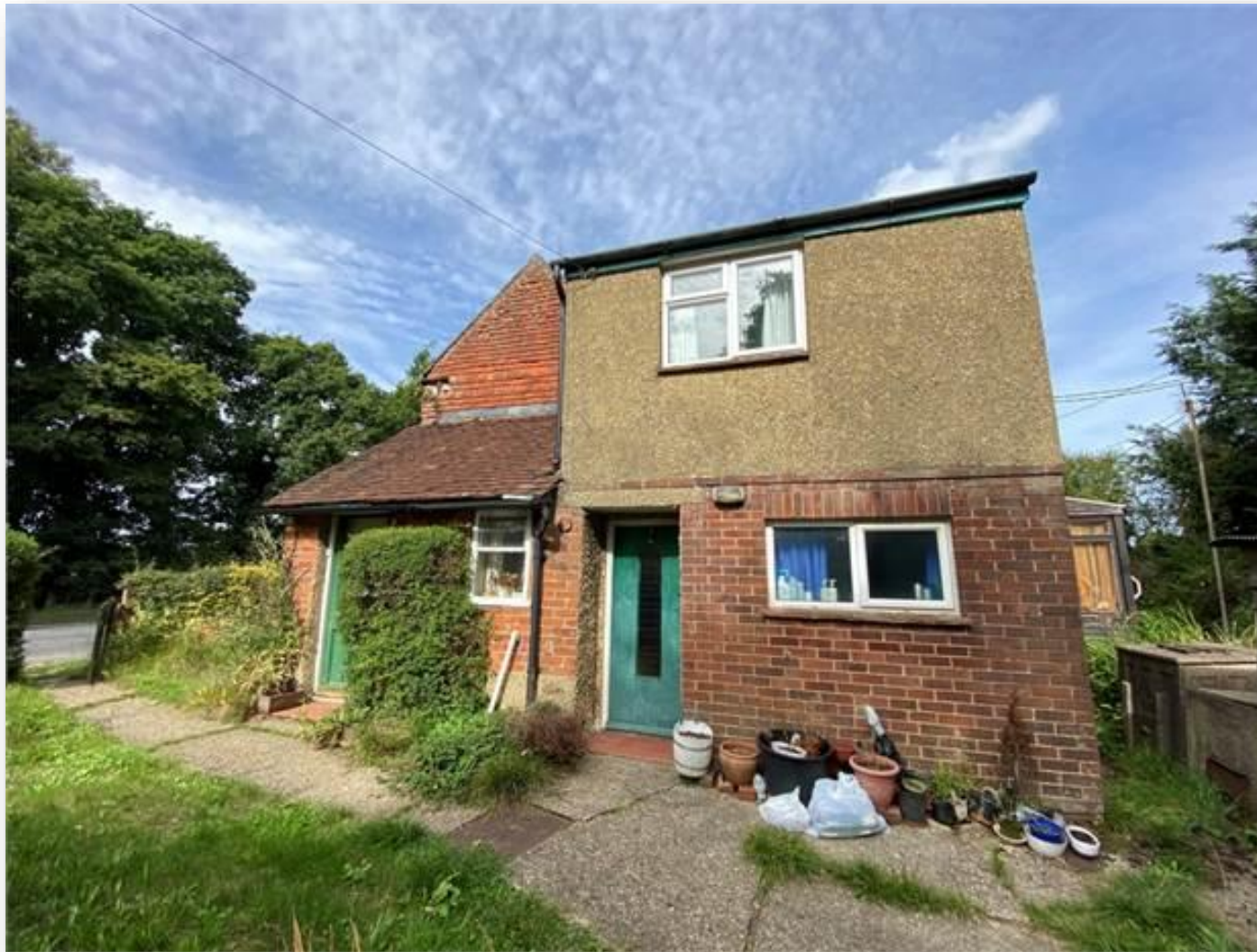
2 Hope Cottage Waltham Chase