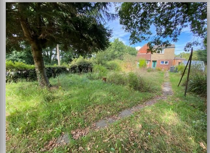
£250,000 Guide Price